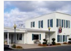
Adams Funeral Home in Crothersville

located 1/2 block west off of Highway 31 at the only stoplight in the heart of Crothersville