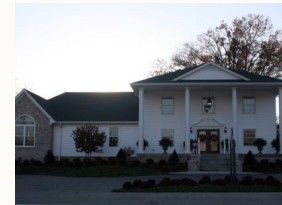
Adams Funeral Home in Henryville

located one block south of 4-way stoplight on Highway 31 in the heart of Henryville