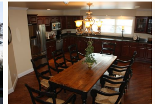
Henryville family lounge